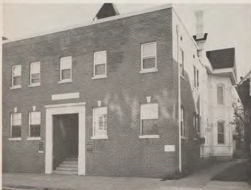
The Lodge Building on East Main Street